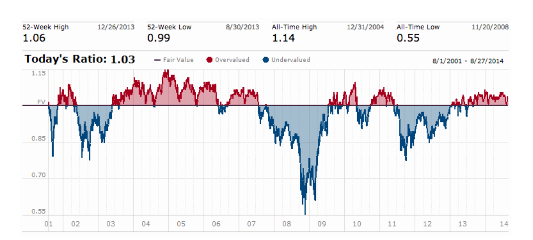
Exhibit 4 Market Valuation

Uncertainty = Range of sales * operating leverage * financial leverage + contingent event discount